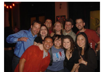
A group of young engineers at the National ASCE Conference in downtown Orlando, FL.