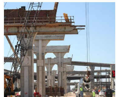
Here is a picture of the current progress on the supports for part of the interchange.

More details on time of tour, meeting location, and how to RSVP are coming soon via email.