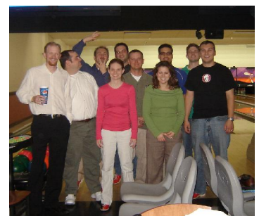
Younger Members at the Bowling Social!