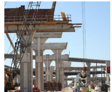
Here is a picture of the current progress on the supports for part of the interchange.

FUTURECITIES: The mission of the National Engineers Week Future City Competition is to provide fun and existing educational engineering programs for 7 th and 8 th grade students that combine stimulating engineering challenges with "hands-on" application to present their vision of a city for the future. On Saturday, January 19 th , some Younger Members met at San Jacinto Central Community College to help judge various students' projects. Thank you everyone who was able to come out and judge these remarkable future cities!