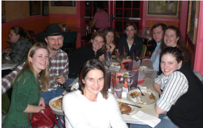
Here are a few Younger Members at Chuy's Restaurant in Austin, TX.

2008 REGIONAL YOUNGER MEMBER COUNCIL LEADERSHIP CONFERENCE: Held in Austin, TX, seven younger members attended this conference on January 25th and 26th. We learned about leadership skills, studied difference career development paths, and networked with other YMF groups within our Region.