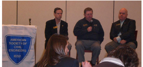
Executive Director, President, and President-Elect of ASCE at the Regional Conference.

This event was a great success and our 2.5 mile stretch of highway is much cleaner!! Thanks to everyone who spent their Saturday with us!